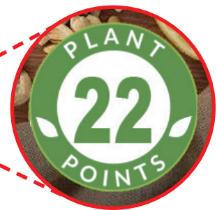
22 Plant Points in our Broccoli Cashew Alfredo Savory-Bowl!